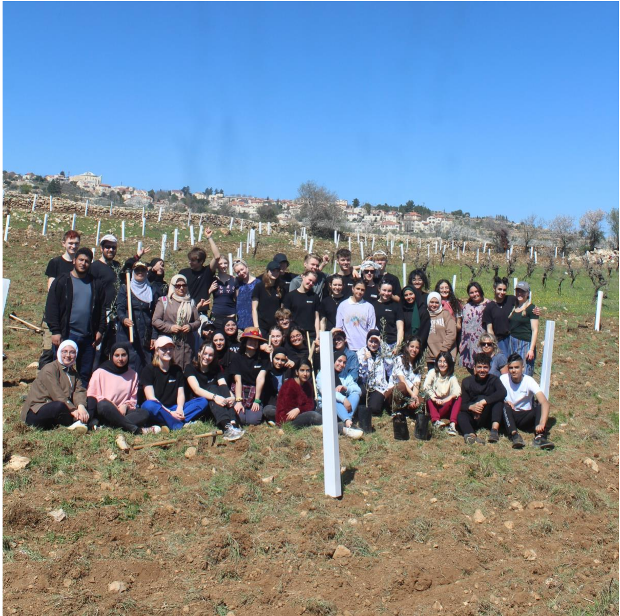
Danish and Palestinian students planting olive trees in March, 2023