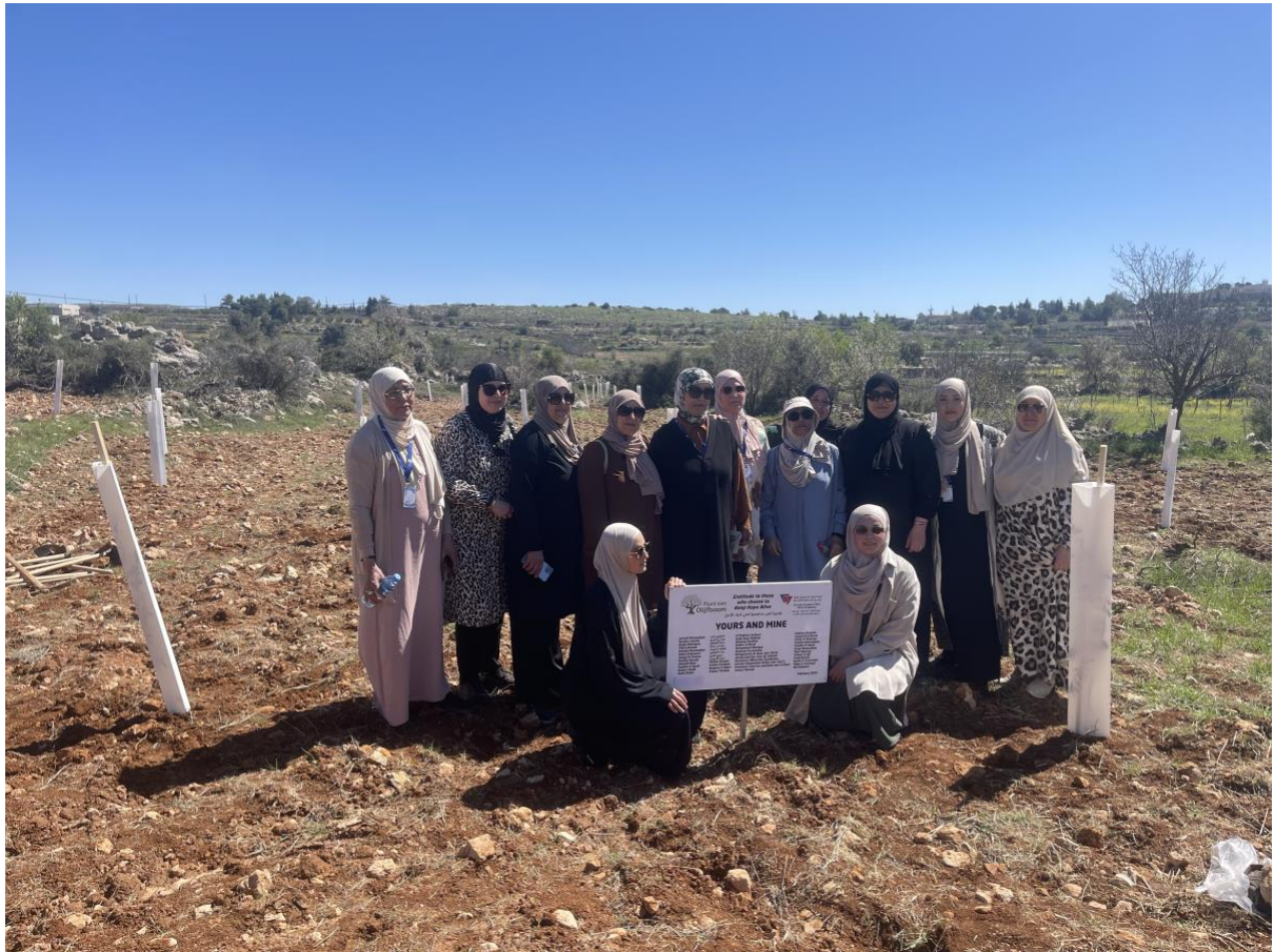
Olive tree planting activity by a dutch group. March 2023