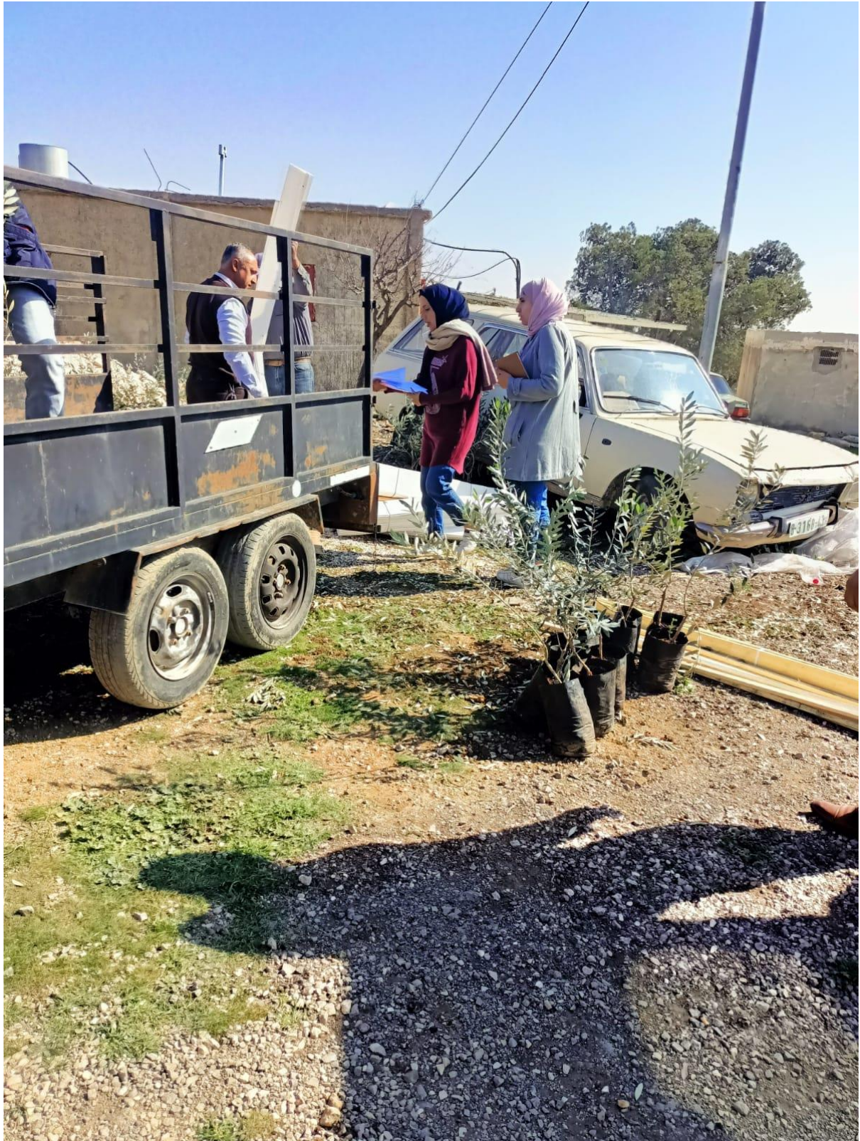
JAI staff distributing olive tree saplings in Hebron. January 2023

In September 2022, JAI signed a contract with an olive tree nursery (which included tree selection criteria) to provide the OTC with tree saplings. JAI then purchased the olive trees from this nursery,