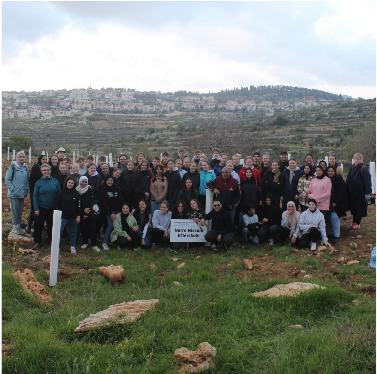
Danish and Palestinian students planting olive trees in March, 2023